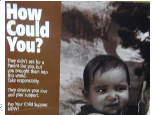
A Navajo Nation child support enforcement poster urges responsibility.